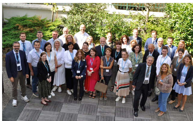
Annual meeting of PRM experts in Paris, 8 September 2023

The sub-group meeting was followed the next day by the fourth meeting of the PRM Experts Group, which allowed for further discussion on assistance dogs with inputs from a wider group of industry experts and FAL sub-group members. Member States heard from industry on the challenges industry faces in providing PRM assistance. They heard about innovative approaches being taken to provide different levels of assistance according to specific passenger needs. Presentations were given on assistance dogs, proposals for a United Kingdom Airline Accessibility Framework, and the advocacy campaign, Rights on Flights. ■