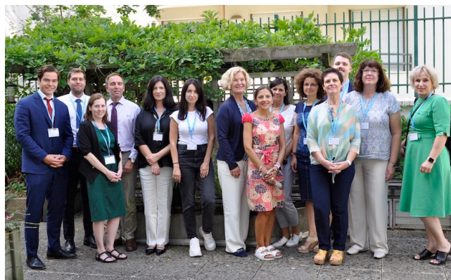
Members of the Facilitation Sub-Group on immigration matters meet in Paris, 6 September 2023

The meeting heard a presentation from the Netherlands on work under its National Facilitation Committee and participants agreed that – where possible – facilitation experts should continue to support and share best practice on National Facilitation Committee approaches across ECAC Member States.