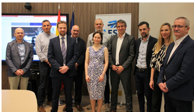
Cyber security experts at their meeting in Madrid in April 2023

A first draft of the group's 2024 priorities was also discussed. One of the meeting's positive outcomes was the commitment to continued active involvement by several study group members in ECAC's cyber security capacity-building activities.