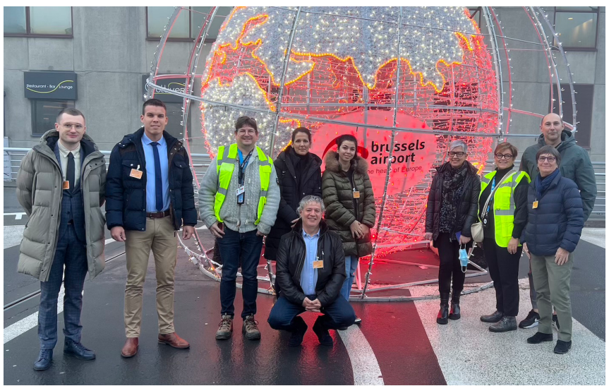
Security auditors attending Best Practices - Level 2 training in Brussels, 28-30 November 2023

Through a combination of theoretical presentations, discussions, and virtual activities, participants gained foundational knowledge about organisational measures concerning cyber threats. This encompassed protective measures to be adopted by operators and entities in addressing cyber threats, covering aspects such as security by design, supply chain security, access control, fostering a cyber security culture, cyber incident detection and response, among others. Additionally, the training encompassed best practices for preparing more effectively for inspecting or auditing cyber security measures within aviation and for conducting on-site inspections/audits.